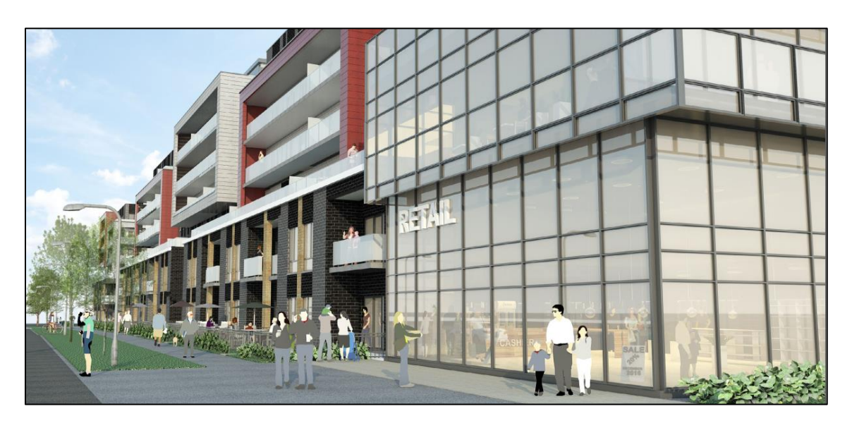
Figure 3: Design rendition of the Vista Local redevelopment

Volume 11 | Issue 1 | 2024 | 68-80 Available online at www.housing-critical.com https://doi.org/10.13060/23362839.2024.11.1.565