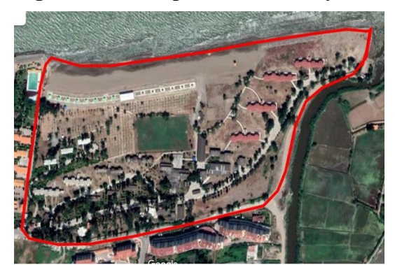
Figure 2: Men's public dormitory site

https://dx.doi.org/10.13060/23362839.2021.8.2.535